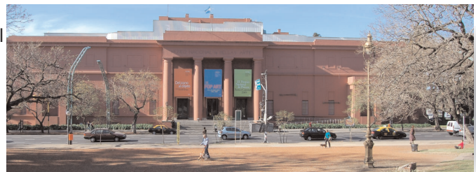
Museo Nacional de Bellas Artes

The city values its European heritage highly; Italian and German names outnumber Spanish. The lifestyles and architecture are markedly more European than any other city in South America.