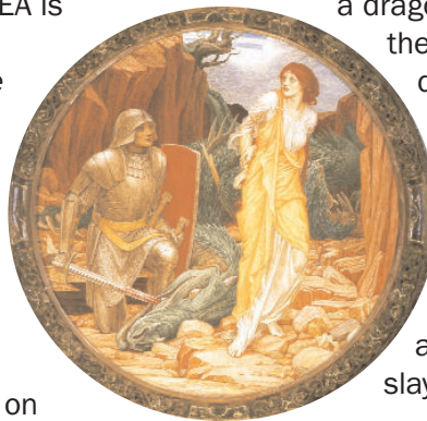
John Dickson Batten, St. George and the Dragon , 1911 or later, Tempera on fabric mounted on board, Museum purchase with funds provided by COMPAS

Legend , a 13th Century source, Saint George fought a dragon by the seashore, outside the walls of the city, in order to rescue the king's daughter from being sacrificed. Batten may also have been inspired by Edmund Spencer's 1595 epic poem, The Faerie Queen . This romantic depiction of a chivalric tale has long been a popular subject for artists such as Uccello, Raphael, Tintoretto, and Rubens. Images of Saint George slaying the dragon were particularly popular in turn of the century England.