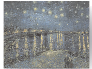
Vincent van Gogh, Starry Night over the Rhone , c. 1888, oil on canvas, Musée d'Orsay, Paris

Enjoy the special exhibition at the de Young Museum, Van Gogh, Gauguin, Cézanne and Beyond: Post Impressionist Masterpieces from the Musée d'Orsay .