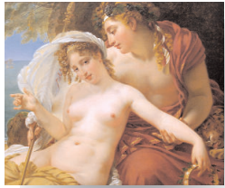
Baron Antoine-Jean Gros, Bacchus and Ariadne , c. 1820, oil on canvas, French, 1771-183, Museum Purchase: funds from anonymous donor