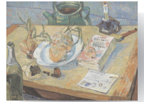
Vincent Van Gogh, Still Life with a Plate of Onions , 1889. Oil on canvas Kröller-Müller Museum, Otterlo, The Netherlands.

The spring European trip will be 10 days in April. London and Paris: Off the Beaten Path will have us visiting lesser known sites such as Kensington Palace , which first became a royal residence for William III and Mary II in 1689, and Apsley House , home of the first Duke of Wellington which houses the Wellington Museum. We'll travel to Oxford and the Blenheim Palace situated in Woodstock, Oxfordshire, England. The palace is the birthplace and ancestral home of Winston Churchill. There will be a Van Gogh exhibition at the Royal Academy of Arts in London. The Real Van Gogh: The Artist and His Letters will feature 65 paintings, 30 drawings and 902 letters he wrote during his lifetime. (Google: Royal Academy of Arts Van Gogh for numerous articles. )