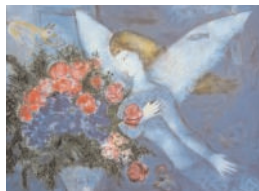
Marc Chagall. Blue Angel , 1937-38 gouache and pastel on paper Lent by Armand Hammer foundation Russian, 1887-1985

Marc Chagall is of the generation following Degas. Chagall blends the sophistication of French painting with the expressive quality of folk art from his native Russia resulting in the disjunctive floating imagery seen here. Unlike the Degas pastel which demonstrates pastel as a drawing medium, the Chagall work with its full coverage and combining with gouache acts more like a painting. Chagall's charming imagery made him one of the most popular painters of the 20th century. The stylistic range in pastel attracted many artists to use it.