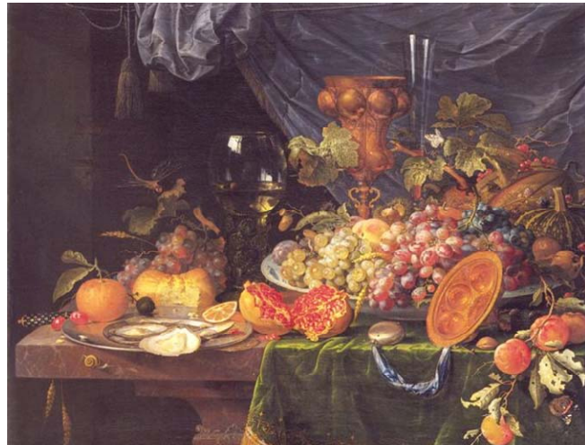
Abraham Mignon (1640-1679)

Featuring special tours of the exhibitions, 17 th century inspired food and drink, strolling entertainers and a silent auction. Masks requested. Proceeds from this event will benefit acquisitions of European art for Phoenix Art Museum.