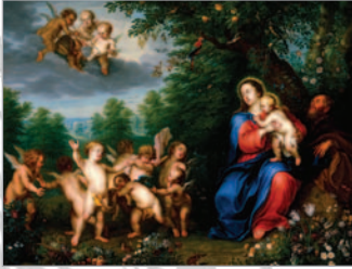
Holy Family with the Infant St. John the Baptist, Balthasar Beschey, c.1730-40. Oil on oak panel. Phoenix Art Museum Collection. Funding provided by FEA.